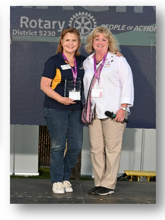
BEST MEDIUM SIZED CLUB – IT WAS A TIE BETWEEN: THE ROTARY CLUB OF CARMEL VALLEY

Then on to the most important, the CLUB AWARDS!! BEST SMALL CLUB – FOOTHILL ROTARY CLUB OF LINDSAY