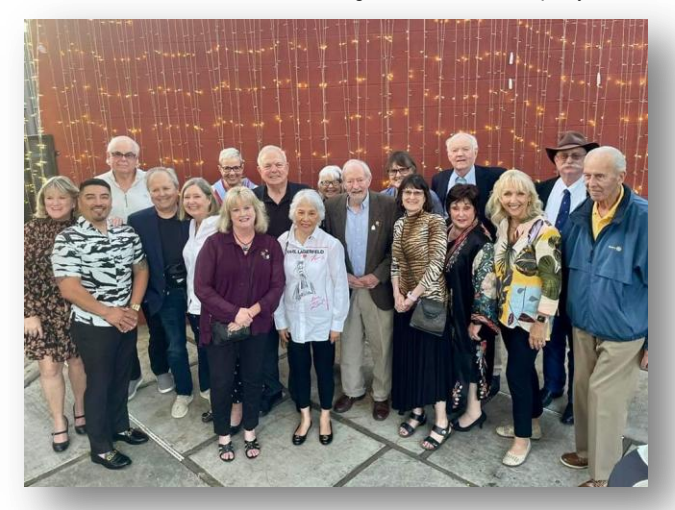
Then on to the Friday night Social at Tioga-Sequoia Beer Garden for some beers and snacks!

We started off on Friday Night with our Past District Governor's dinner at Veni Vidi Vici, great food and company!