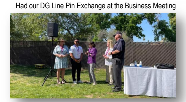
And gave away some awesome raffle prizes