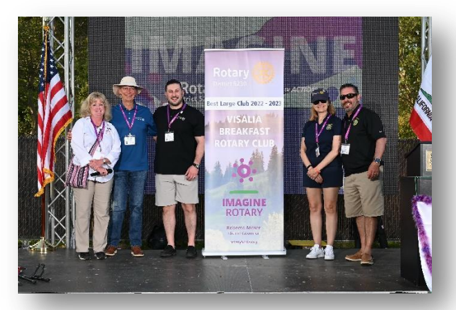
BEST OVERALL CLUB — THE ROTARY CLUB OF VISALIA COUNTY CENTER